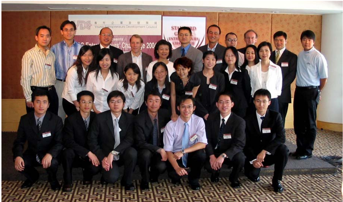
Group photo of the 3 Winning Teams and Guests

The Young Entrepreneurs Development Council (YDC) announced the result of the E-Challenge 2004 in the Prize Presentation Ceremony on 19 June 2004. The E-challenge is an annual competition now in its 5 th year, with overwhelming response this year of over 100 entries from all seven universities. It has bred the entrepreneurial spirit and raised the level of entrepreneurial skills among local university students.