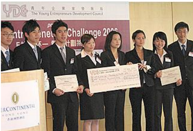
2 nd Runner Up Team "Themix"

"TrueArt Moxi" is a digital painting software. It has a user-friendly and intuitive interface that enables the user to freely rotate the canvas in 3-dimensions. TrueArt Moxi uses 3D physics algorithms to realistically simulate how ink particles spread on paper. "CapNWatch" creates a brand new way to reveal the power of instant multimedia anytime, anywhere. Using C-Code, a development of QR-Code technology, a mobile phone can "capture" code on a printed material, transform it into video or related information "Thermax" is a semiconductor thermoelectricity generator that converts waste heat from the central air conditioning system into electrical energy, which would then be used by the air conditioner again.